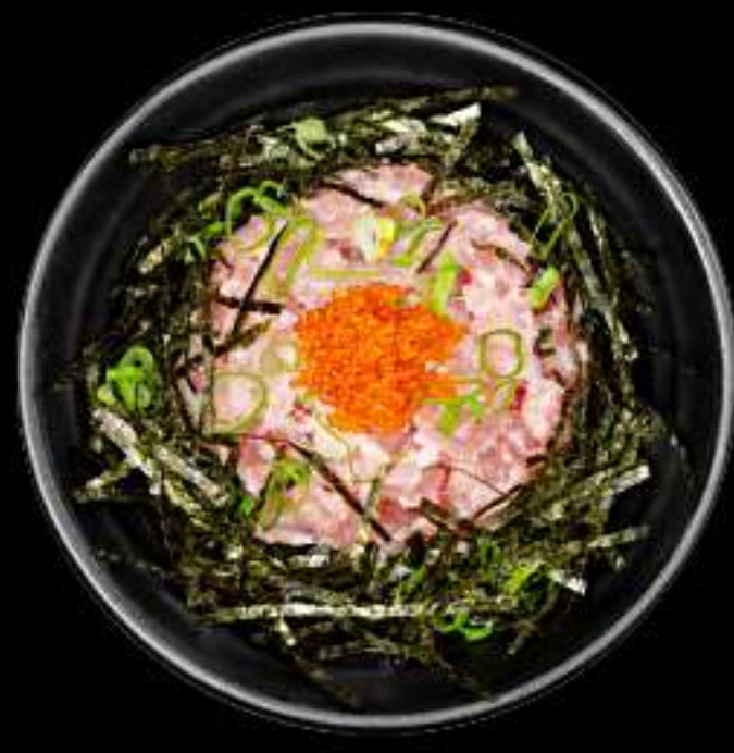
Toro Mini 30g

( Coca Cola , Diet Coca , Nestea , Canada dry , sprite , Water )