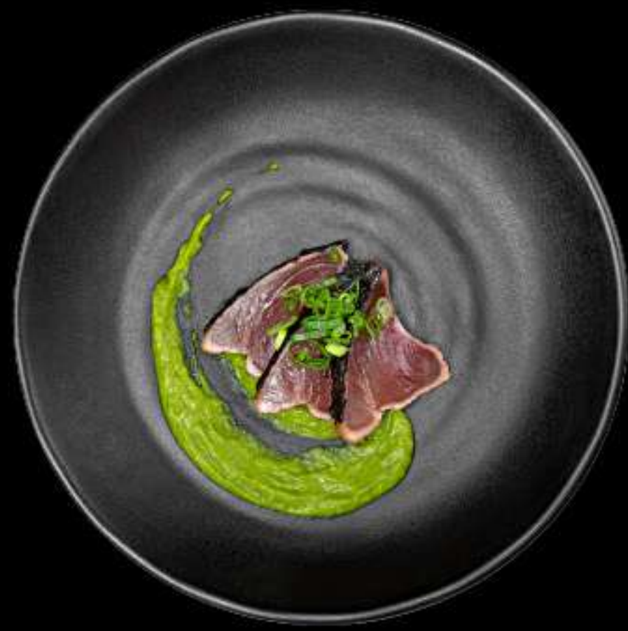
Smoked Bonito Sashimi

With house made jalapeño garlic paste, ponzu sauce, green onion