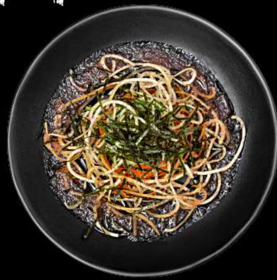
Crispy Taro salad

House made Passion fruits dressing Cucumber, carrot, seaweed