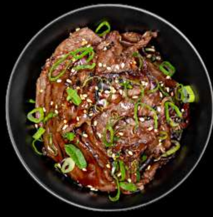
Wagyu Mini 50g

Japanese bbq sauce, sesame , green onion