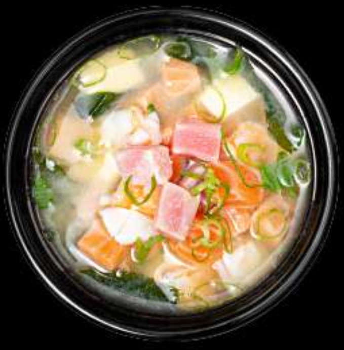
Ocean Miso Soup

Butter fish, shrimp, salmon, tuna , tofu, seaweed , tofu , green onion