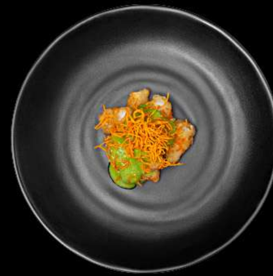
Yuzu Tempura Shrimp

Crispy Yam with house made yuzu mayo & jalapeño garlic paste